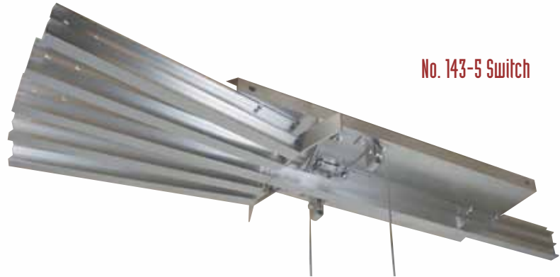
No. 143-5 Switch