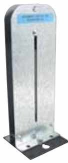
No. DFB-2 1 - 5 lbs. 15 oz. With 5" diameter ball-bearing wheel.