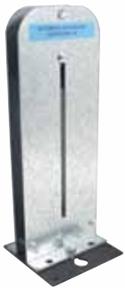
No. DFB-1 1-5 lbs. 12 oz. With 3" diameter sleeve-bearing wheel.