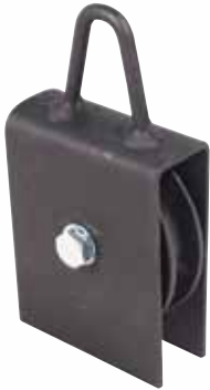
No. LCP-1 1-1 lb. 6 oz. 3" long x 1" wide x 3-1/2" high.

LIFT CURTAIN PULLEYS are used for raising and lowering gym divider, top masking, and other type curtains where a swivel type action is desirable.