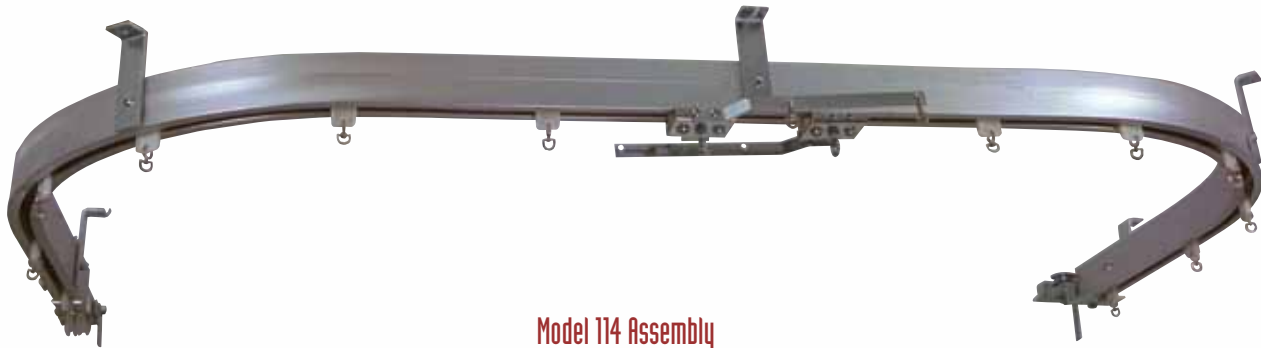
Model 114 Assembly