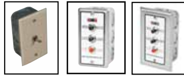
Close-up of RCS (standard non MCS Models) Close-up of RCS-1 (standard MCS Models) Close-up of RCS-2 (optional MCS Models)

AUTODRAPE® Model 1452 SILVER SERVICE® Model 2902 HERCULES® Model 6502