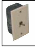
Close-up of RCS

NOTE: Guard not shown. Required for ETL compliance.